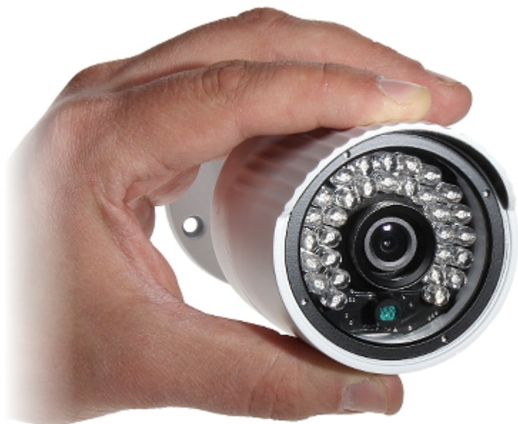
Side view (the cable is hidden inside the bracket):