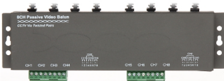
Example application for CVBS/PAL cameras: