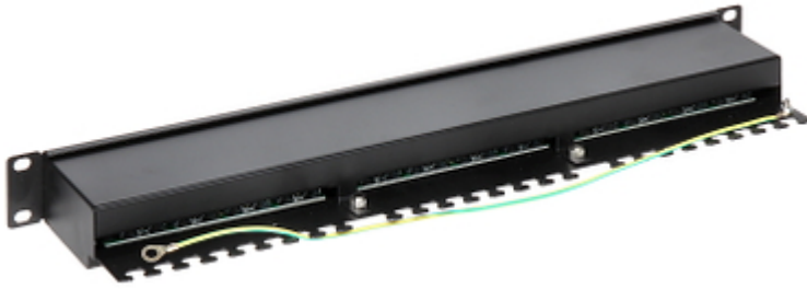
Internal view, after remove the cover: