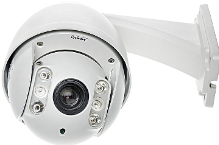
Small dimensions camera: