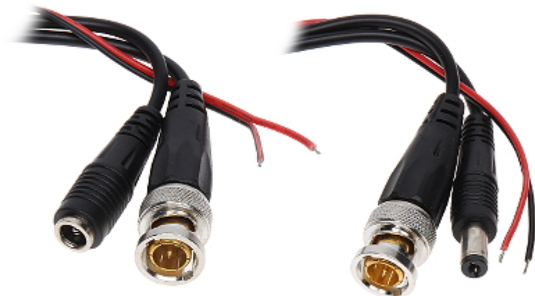
Wiring sequence inside the RJ-45 plug: