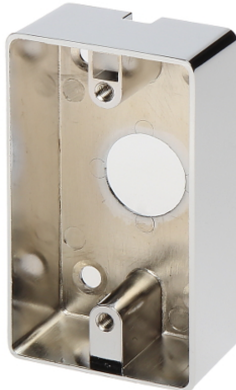
Surface box designed for ATLO-PA-1 buttons.

The device must be secured against contact with caustic, staining and viscous fluids.