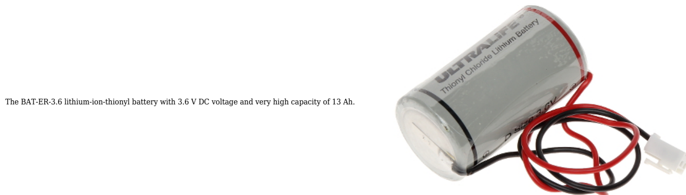
The BAT-ER-3.6 lithium-ion-thionyl battery with 3.6 V DC voltage and very high capacity of 13 Ah.

To return a worn-out product, use a collection and disposal system of this type of equipment or contact a seller from whom it was purchased. He will then be recycled in an environmentally-friendly way.