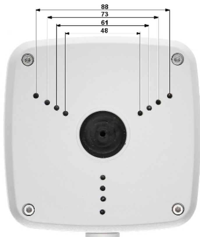
View of the ceiling mounting side: