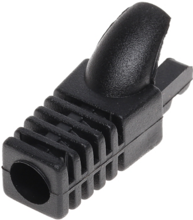
Example of application: