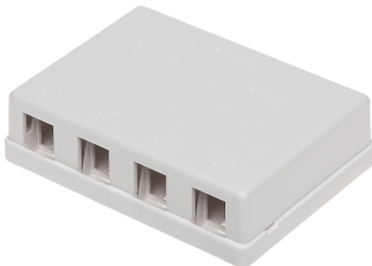
Mount box for KEYSTONE connectors.

The device must be secured against contact with caustic, staining and viscous fluids.