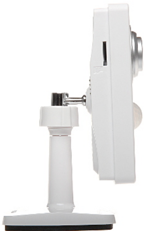
Camera mounting dimensions: