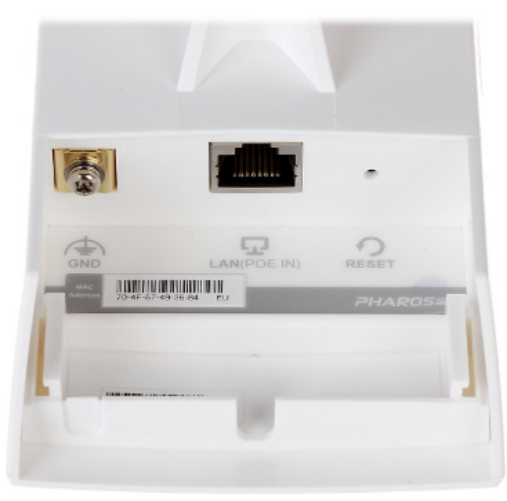
PoE Power Supply and Adapter:

Code: TL-CPE210 ACCESS POINT TL-CPE210 2.4 GHz TP-LINK