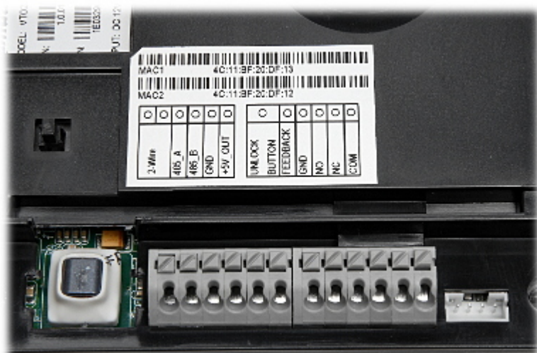
Connection schematic diagram: