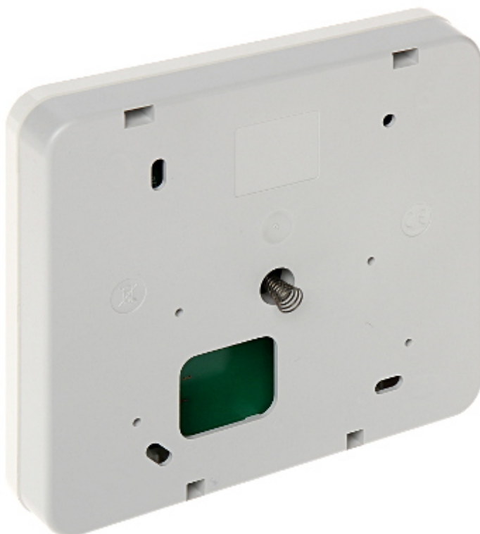
View after remove the cover: