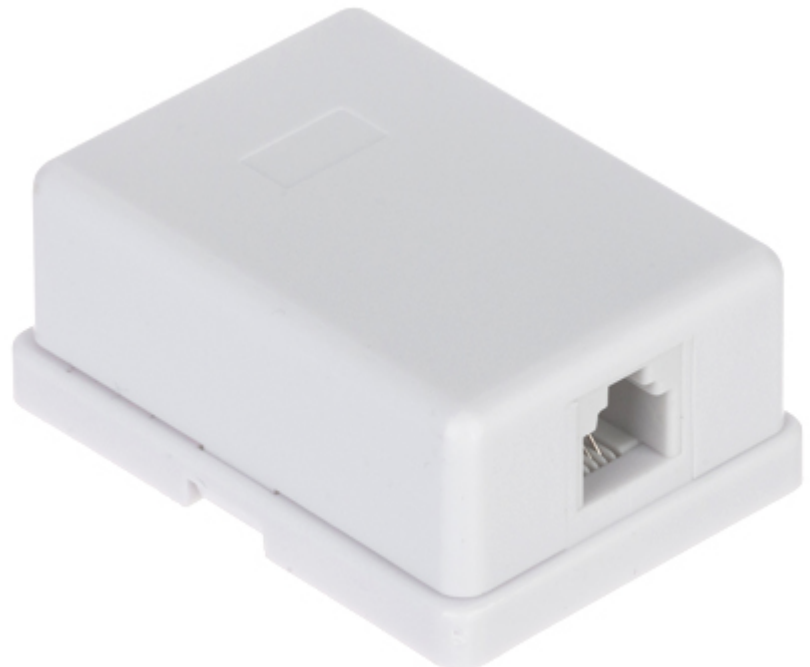
Surface outlet with connector. RJ-11.

The device must be secured against contact with caustic, staining and viscous fluids.