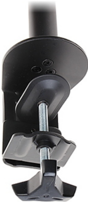
Possibility of mount adjustment: