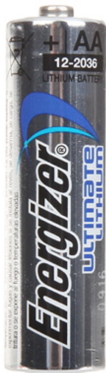
Comparison of Lithium and Alkaline batteries capacity: