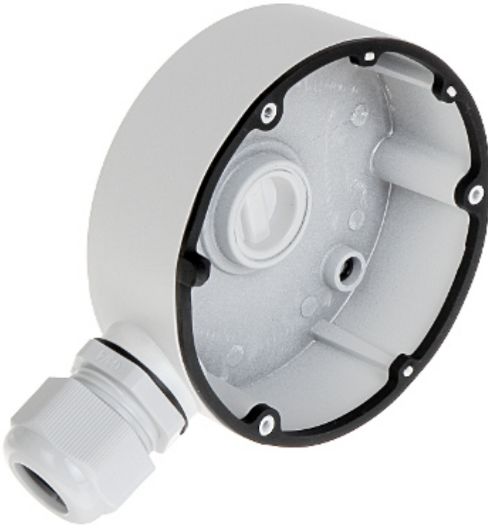
Wall mounting side view