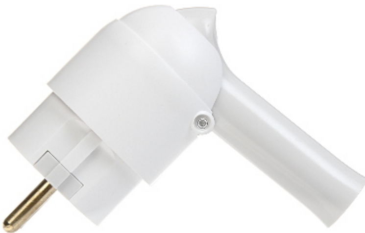
Internal view of the housing: