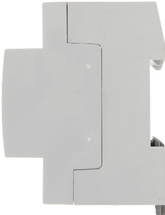
Mounting side view