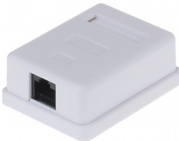
Surface outlet with connector.

The device must be secured against contact with caustic, staining and viscous fluids.