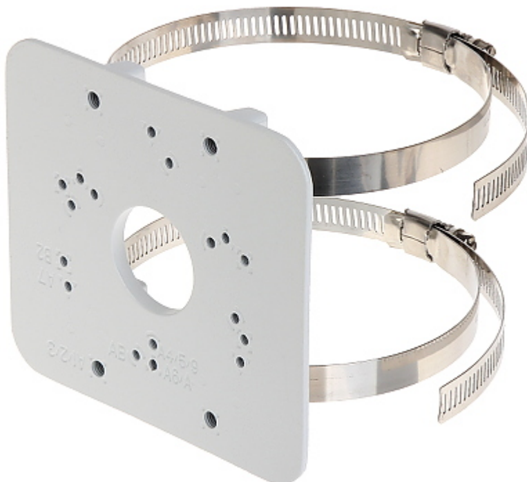
Mount designed to camera installation on a pole.

The device must be secured against contact with caustic, staining and viscous fluids.