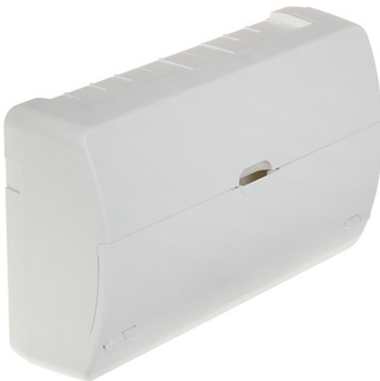
1-row 16-modular surface-mounting distribution electric cabinet.

The device must be secured against contact with caustic, staining and viscous fluids.