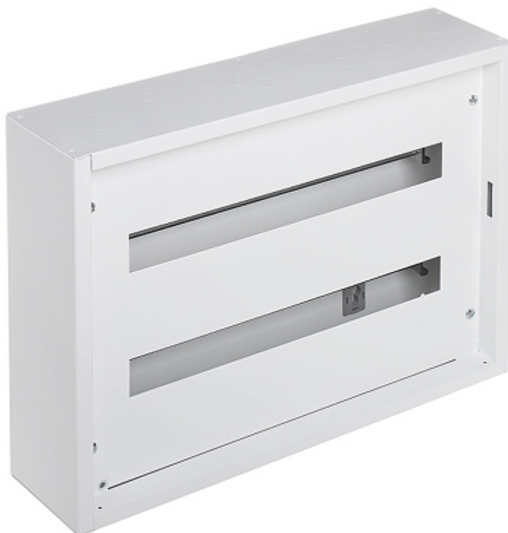
2-row 48-modular surface-mounting distribution electric cabinet.

The device must be secured against contact with caustic, staining and viscous fluids.