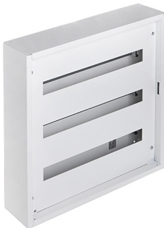
3-row 72-modular surface-mounting distribution electric cabinet.

The device must be secured against contact with caustic, staining and viscous fluids.