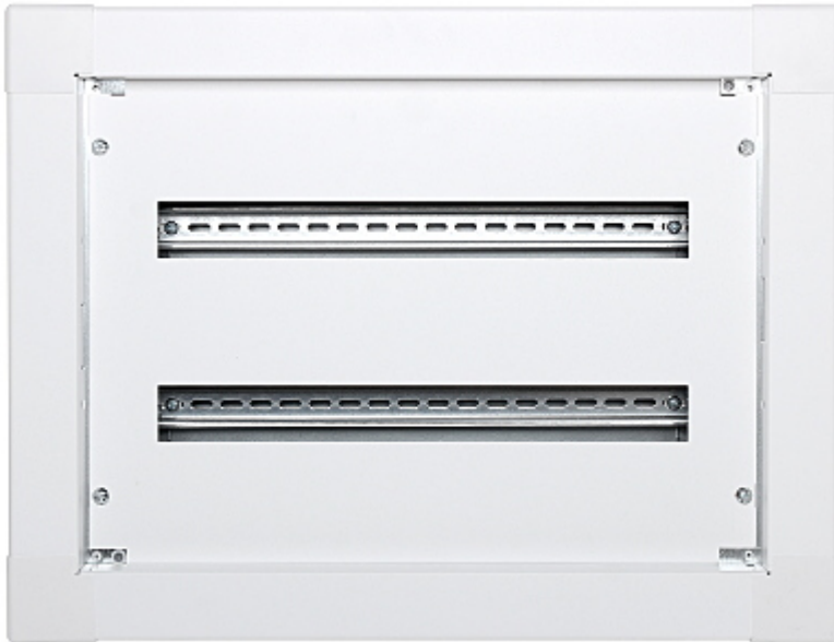
Internal view of the housing: