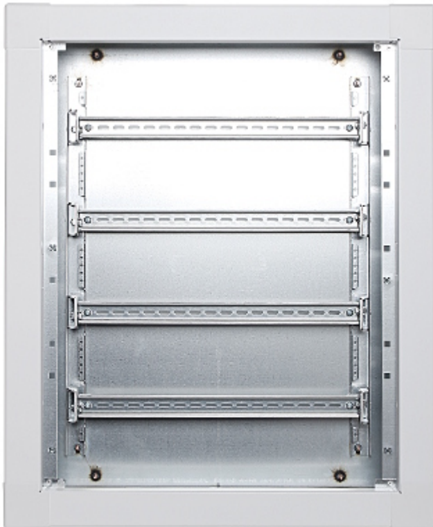
Mounting side view