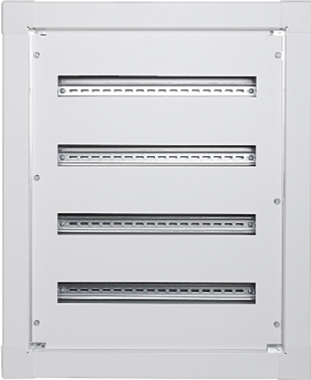
Internal view of the housing