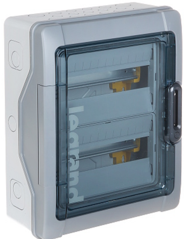
2-row 24-modular surface-mounting, hermetic distribution electric cabinet.

The device must be secured against contact with caustic, staining and viscous fluids.