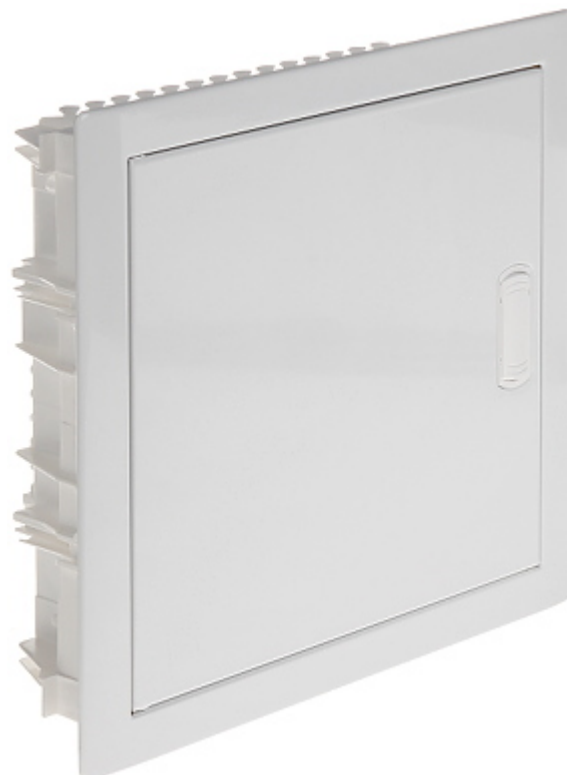
1-row 12-modular flush-mounting distribution electric cabinet.

The device must be secured against contact with caustic, staining and viscous fluids.