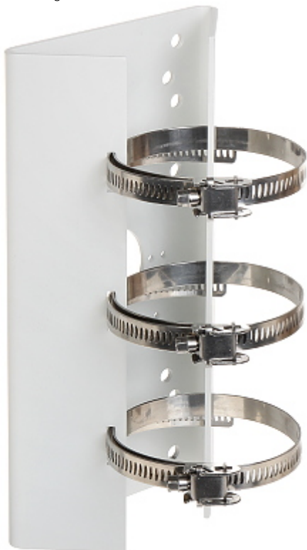
Example of application: