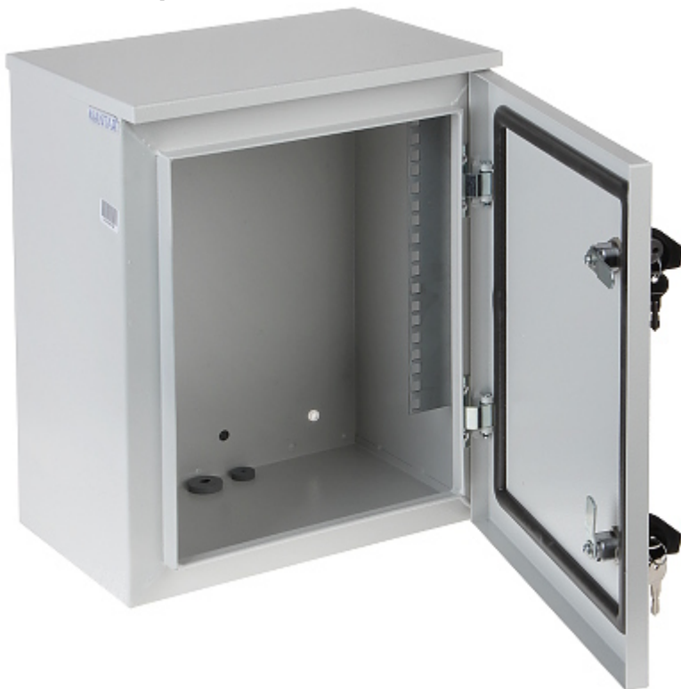
Cabinet with door open