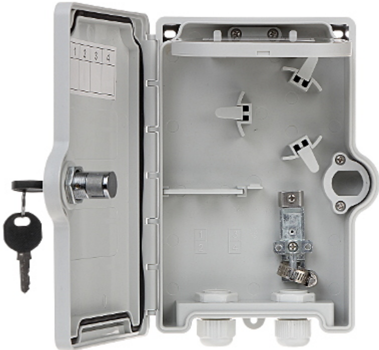
Mounting side view