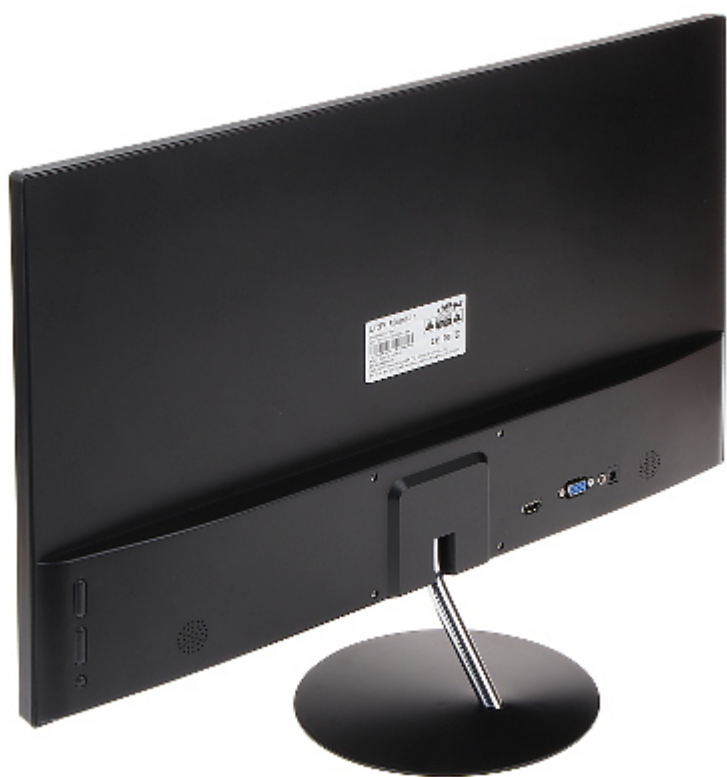
OSD menu control keys: