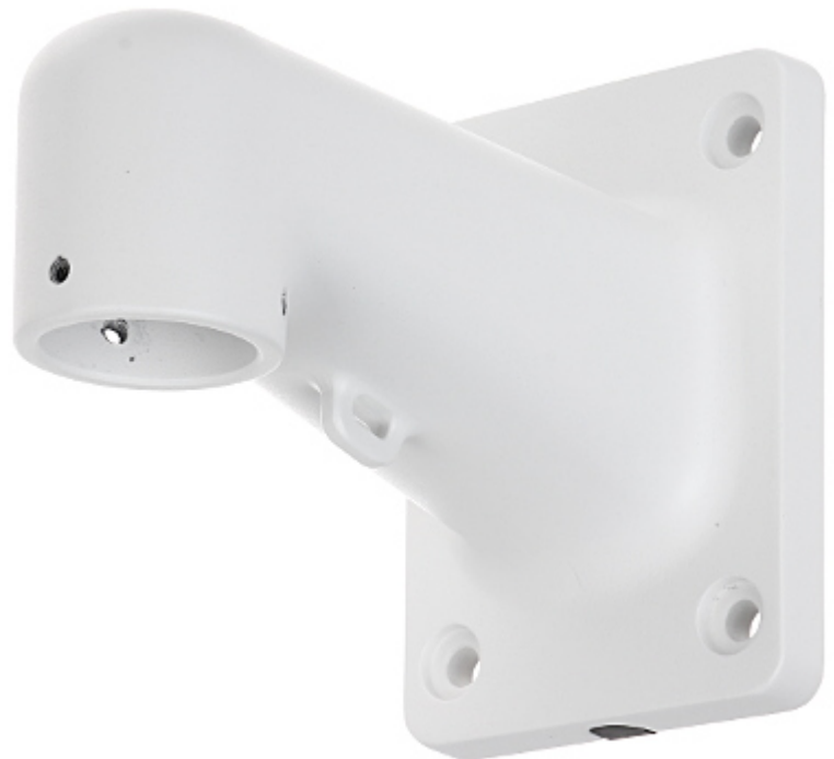
Wall bracket. Designed to PTZ Dahua cameras. It can be used to vandal-proof cameras installation.

The device must be secured against contact with caustic, staining and viscous fluids.