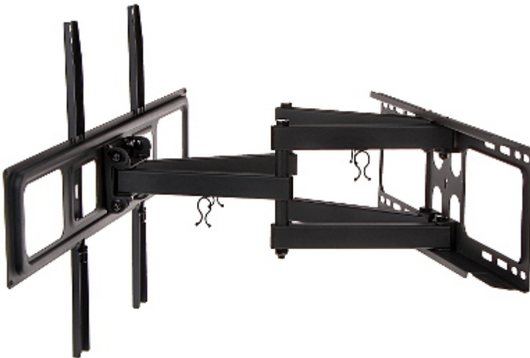
Wall mounting side view