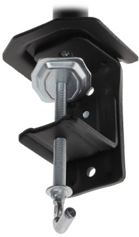
Possibility of mount adjustment: