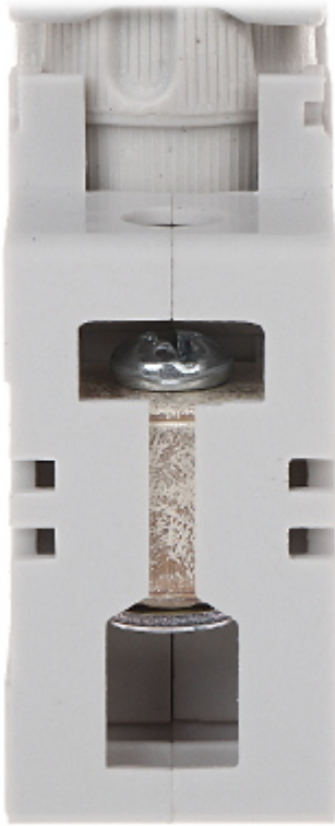
Mounting side view