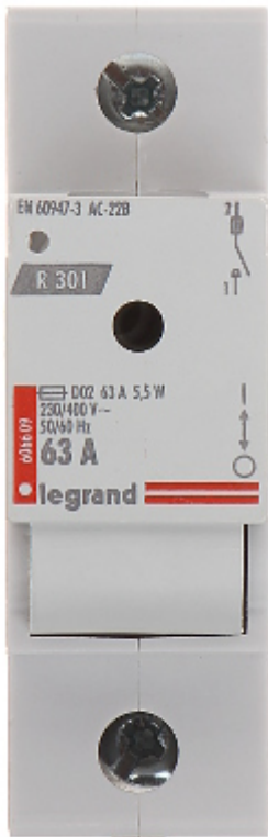
Open cover of fuse links