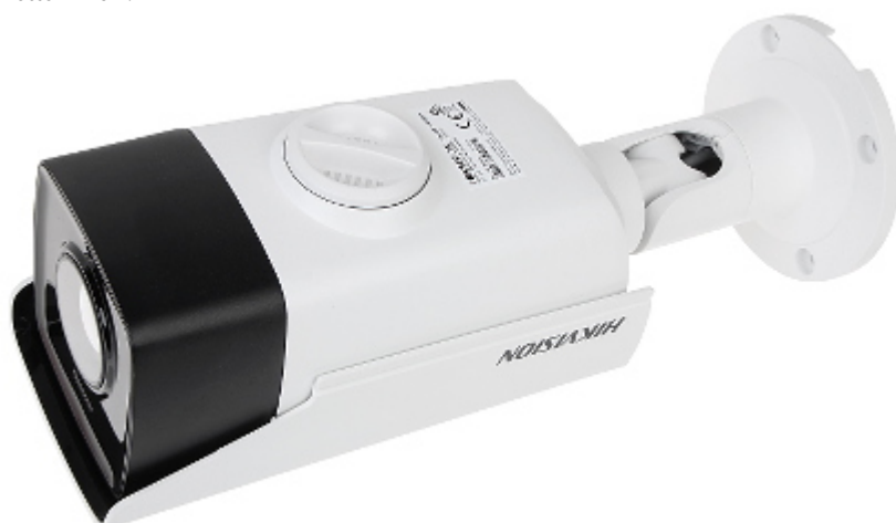
Bottom view (control panel):