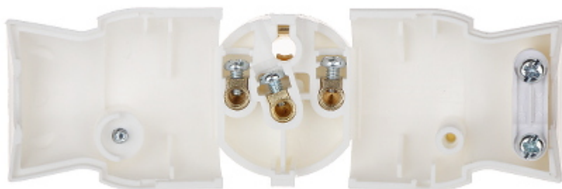
Cable mounting side view: