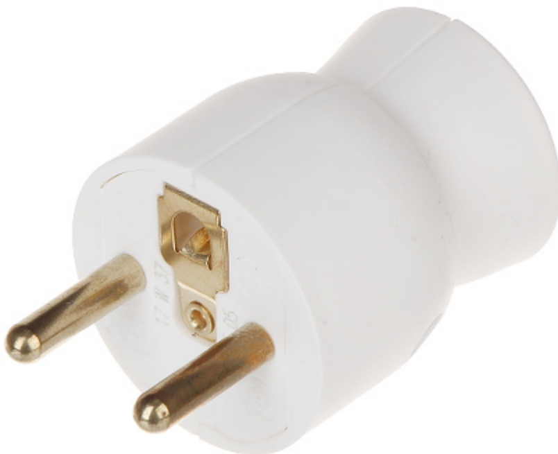
Plastic straight plug.