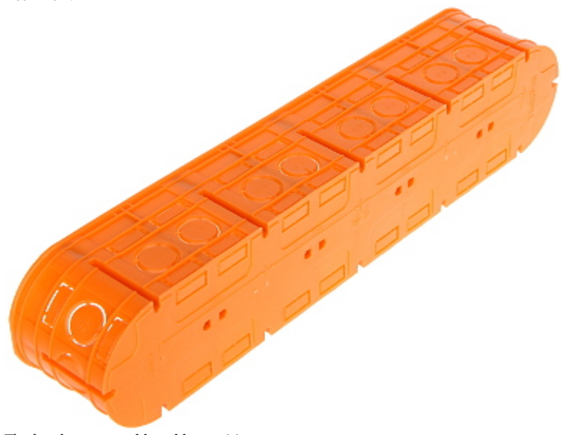
The box has removable cable partitions: