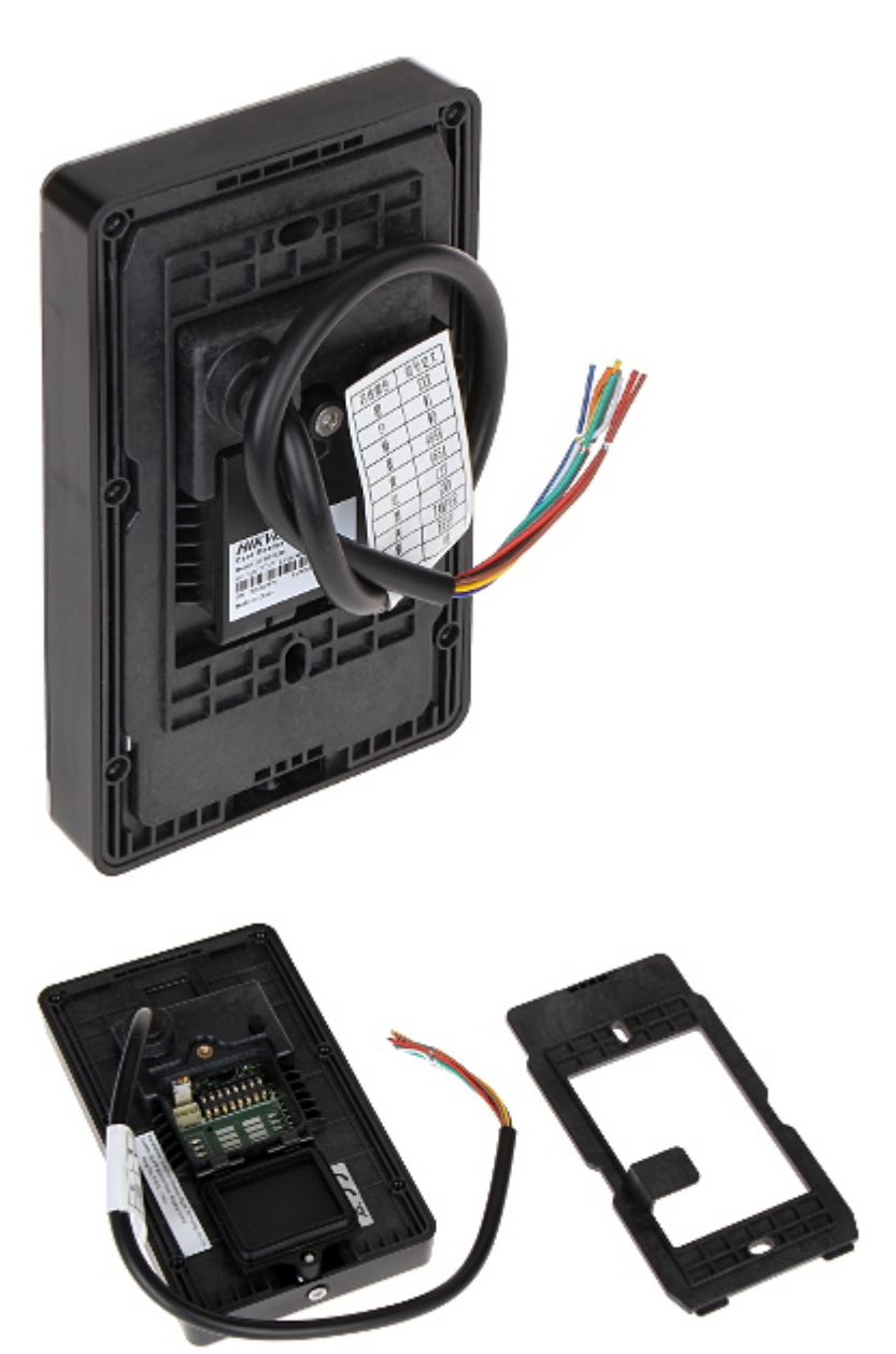
On the body, under the cover there are placed configuration switches:

Code: DS-K1103MK PROXIMITY READER DS-K1103MK Hikvision