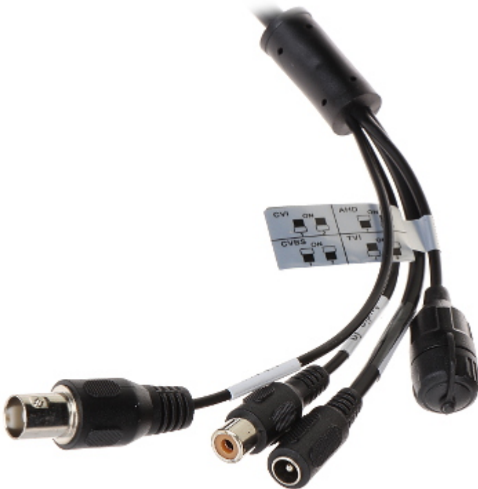
Standard changes are made using configuration switches: