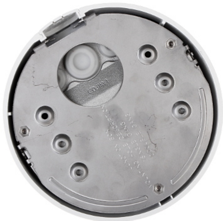
Bottom view (after remove the cover):