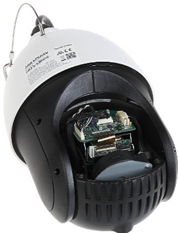
Micro SD card slot is located inside the camera: