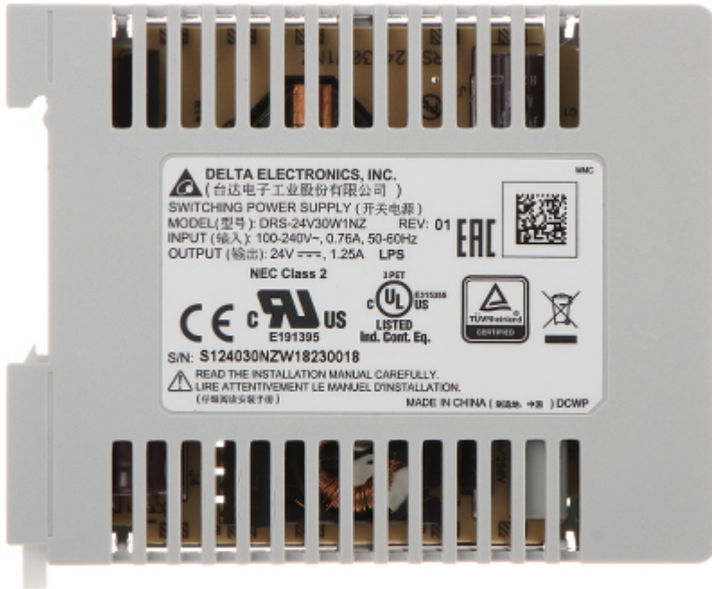
Rear panel (DIN rail installation):