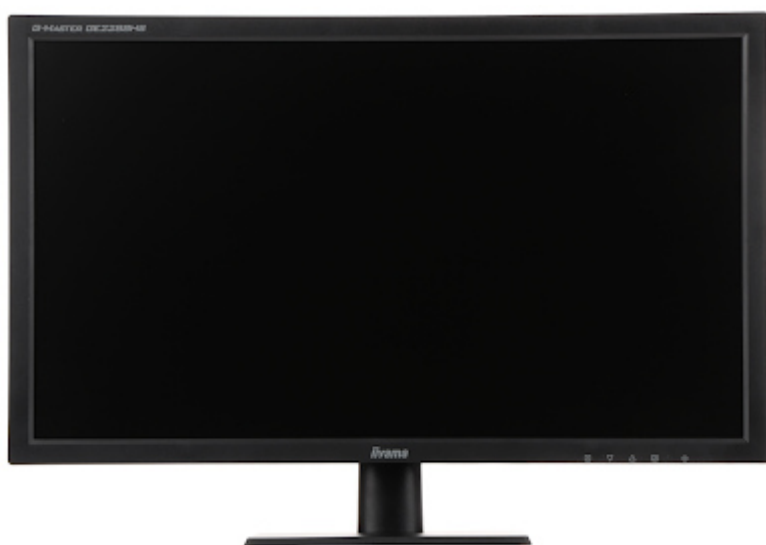
OSD menu control keys: