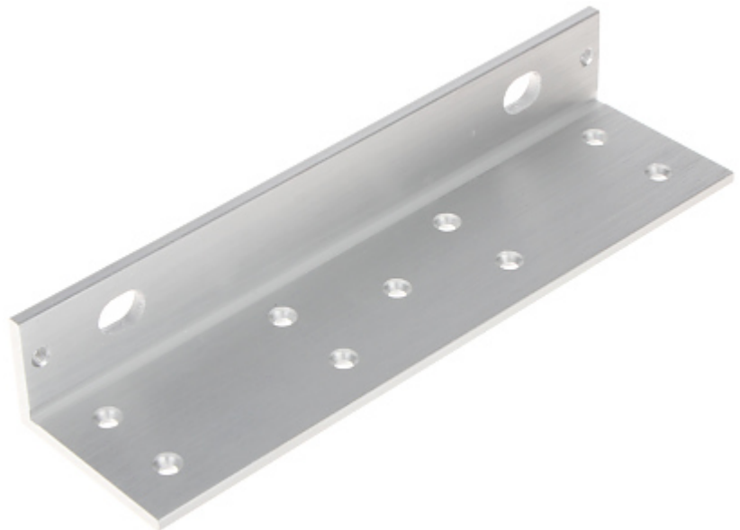
Mounting L-bracket for electromagnetic lock.

The device must be secured against contact with caustic, staining and viscous fluids.