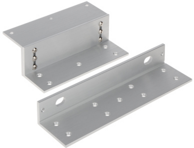
Z-bracket and L-bracket set for the ASF500A / ASF500B electromagnetic lock with load capacity of 500 kg.

The device must be secured against contact with caustic, staining and viscous fluids.