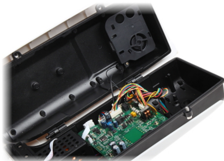
Micro SD card slot is located inside the camera: