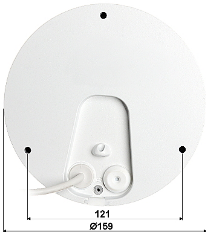
Camera with mounted bracket (bracket included):